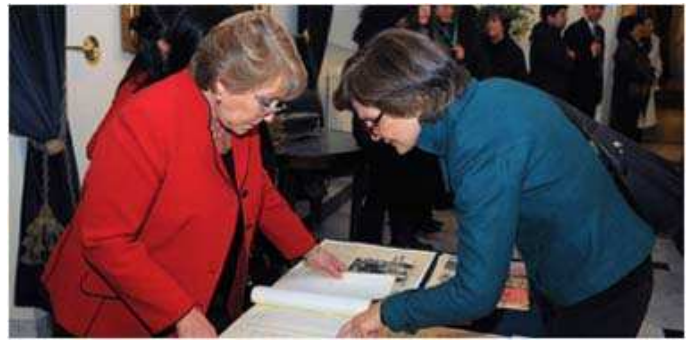
Chilean President Michelle Bachelet presided over the signing of an agreement which will ensure the preservation of exhibit donation made to the new Museum of Memory and Human Rights.

(June 18, 2009) President Michelle Bachelet officially received exhibit donations on Tuesday to be displayed in a new ‘Museum of Memory and Human Rights’ that will commemorate victims of Chile’s military dictatorship, which took place between 1973 and 1990 under Gen. Augusto Pinochet.