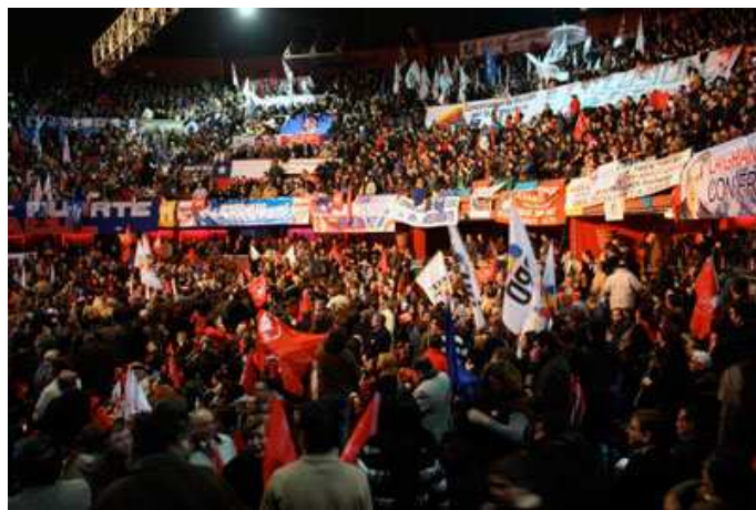
The crowd supporting Frei at the Teatro Caupolicán.

But Frei didn’t seem concerned Wednesday night. Marcos Enriquez-Ominami is an “adventurer,” he said, and the country saw enough of the right under Pinochet.